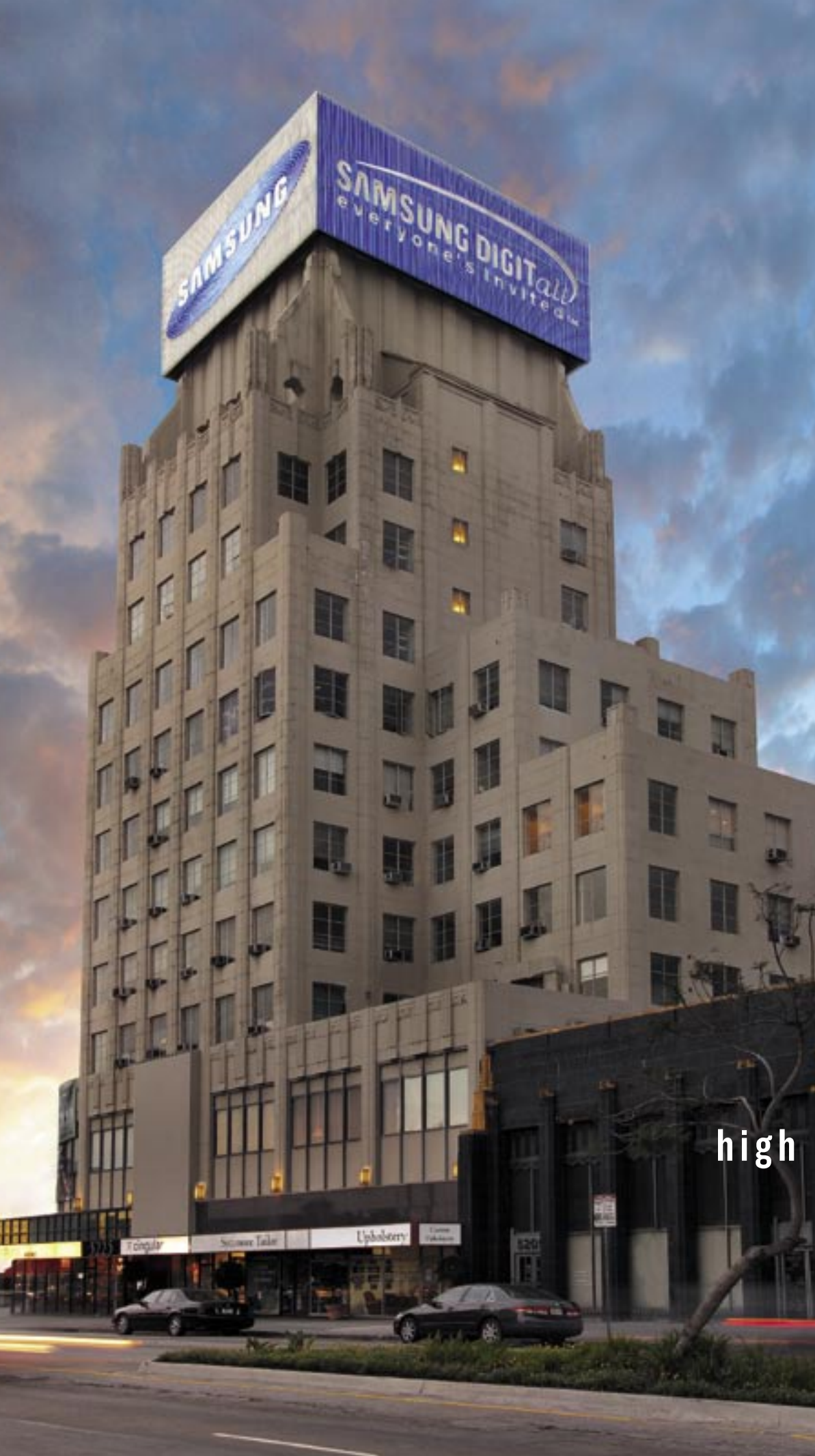
Los Angeles, California