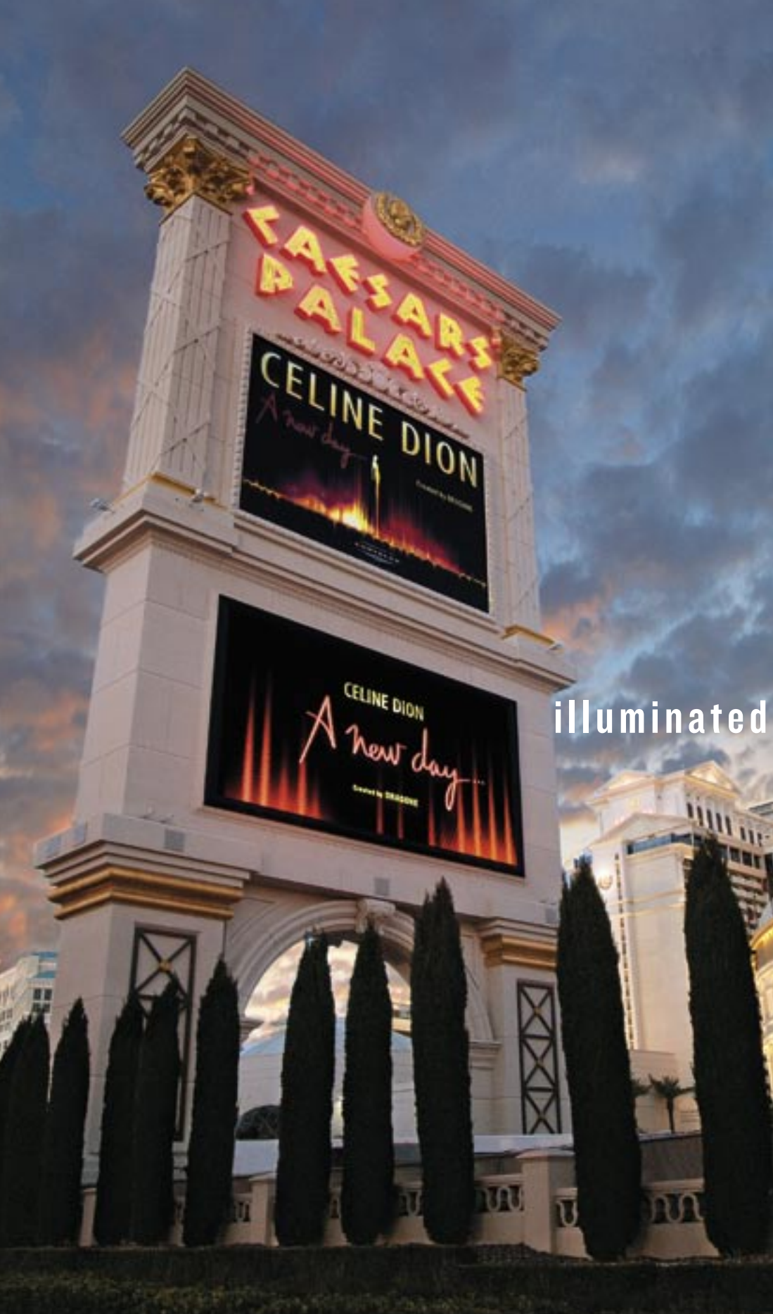
Las Vegas, Nevada