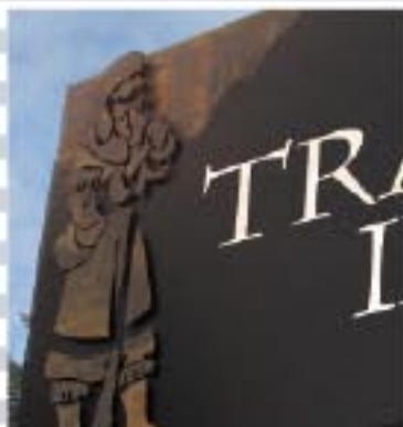
Non-Illuminated vs. Illuminated