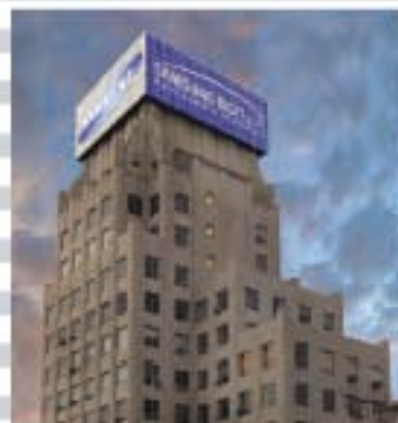
High vs. Low