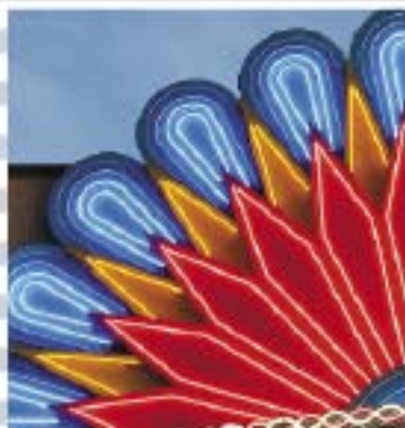
Complex Multi-color vs. Simple Neon

A PUBLICATION FOR THE CUSTOMERS, FRIENDS AND EMPLOYEES OF YOUNG ELECTRIC SIGN COMPANY / SEPTEMBER 2003